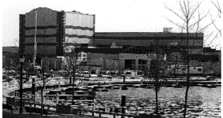
Vibro-Acoustics supplied rectangular and T-elbow silencers for this indoor/outdoor facility in Camden, New Jersey.

NOTE OF INTEREST: This unique theater is a prototype for future multi-purpose entertainment facilities and is the first indoor/outdoor facility of its kind in the U.S. Flexible design challenges were accentuated by uses ranging from 25,000 seat outdoor pop music events to 1,600 seat indoor classical concerts.